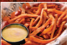
Sweet Potato Fries...$3.95