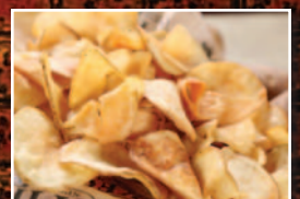
House Potato Chips...$2.95

Chili Cheese Fries...$4.95 Chicken Tenders...$6.95 Tortilla Chips & Queso...$4.95 Corn Dog...$2.25