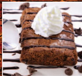
Triple Chocolate Brownie..$3.45

Lattes, Iced Lattes, or Frappuccino...$3.95 Each Vanilla, Hazelnut, Heath Mocha, 20° Below White Chocolate