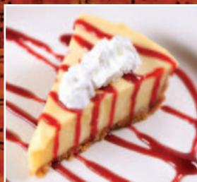
Key Lime Pie..$3.95