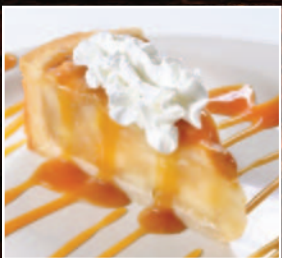
Caramel Apple Pie $3.45