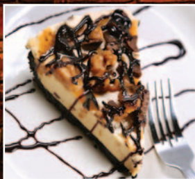
Reese's™ Peanut Butter Pie..$3.95